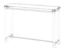
1223 cm. 115x35 h.76 1223/A cm. 90x35 h.75