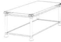
1218 cm. 120x60 h.45 1218/A cm. 130x70 h.45