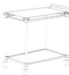
1215 cm. 78x44 h.70