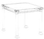
1219 cm. 60x60 h.50 1220 cm. 80x80 h.45