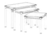
1222 cm. 64x40 h.48 cm. 52x40 h.41 cm. 40x40 h.34