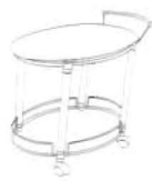
1358 cm. 78x48 h.71