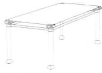
1216 cm. 120x60 h.45 1216/A cm. 130x70 h.45