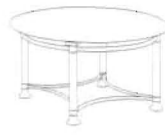
1354 cm. Ø 90 h.45